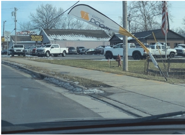
Vehicles parked on grass within the front yard along with illegal ribbon signage