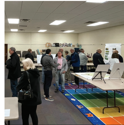
Open House #1 (February 2023)