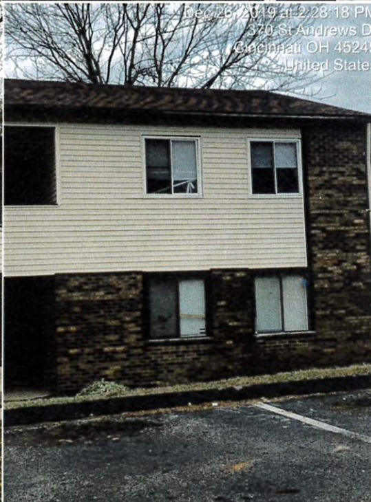
Dec 26, 2019 at 2:28:18 PM 370 St Andrews Dr Cincinnati OH 45245 United States