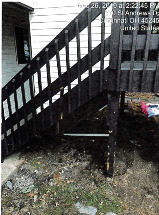
Dec 26, 2019 at 2:22:45 PM 370 St Andrews Dr Cincinnati OH 45245 United States