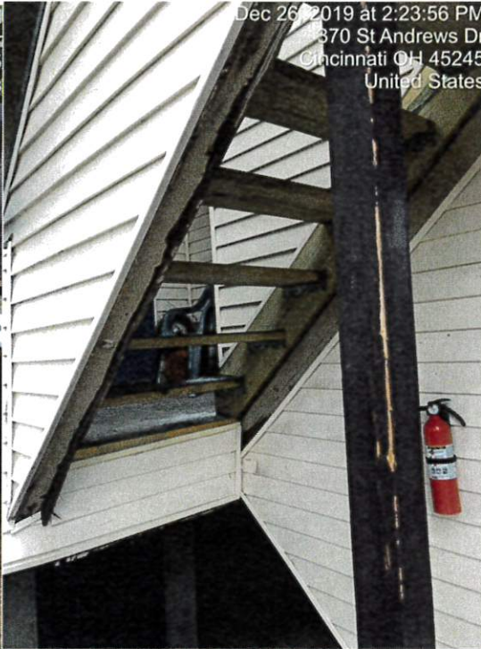
Dec 26, 2019 at 2:23:56 PM 370 St Andrews Dr Cincinnati OH 45245 United States