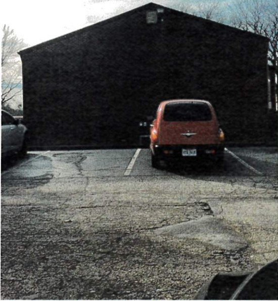
Dec 26, 2019 at 1:55:27 PM 308 St Andrews Dr Cincinnati OH 45245 United States