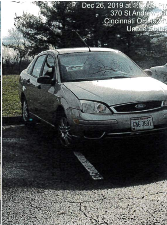
Dec 26, 2019 at 1:59:33 PM 370 St Andrews Dr Cincinnati OH 45245 United States