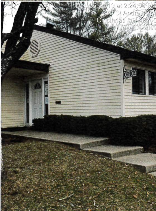
Dec 26, 2019 at 2:24:56 PM 370 St Andrews Dr Cincinnati OH 45245 United States