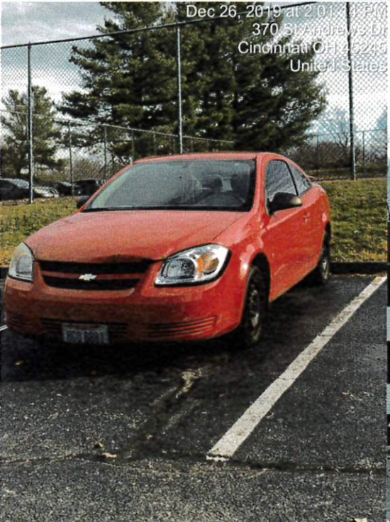
Dec 26, 2019 at 2:01:30 PM 370 St Andrews Dr Cincinnati OH 45245 United States